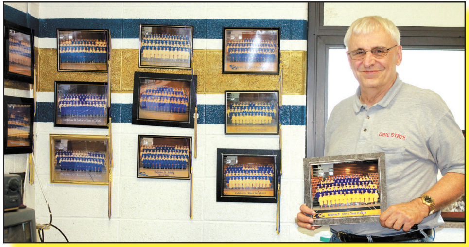
Mr. Huysman has gone into well-deserved retirement after 41 years.

The tables have computer hookups - but no computers. This is where we need your help. The computers and related equipment will cost us about $5000. Currently your fellow alumni have donated $3500.00. This total comes from just two very generous alumni. We thank them both very much!